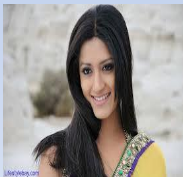
Film Actress Mamta Mohandas