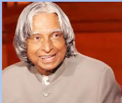
Ex President Of India Shri APJ Abdul Kalam