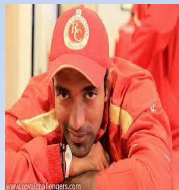
Indian Cricket Team Robin Uthappa