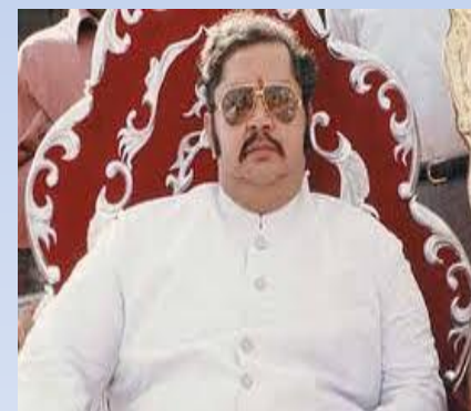
Scion of Mysore Royal Family Srikanta Datta Narasimharaja Wadiyar