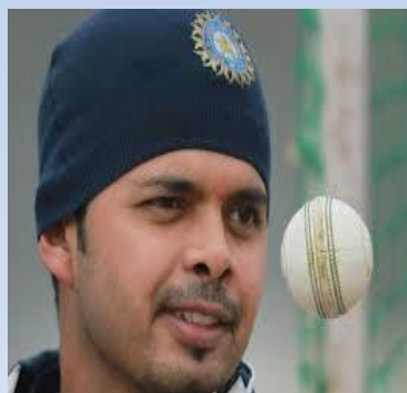
Indian Cricket Team Sreesanth